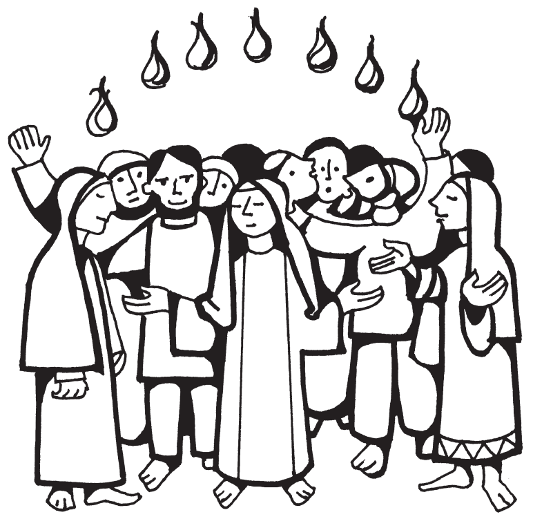
from Acts 2